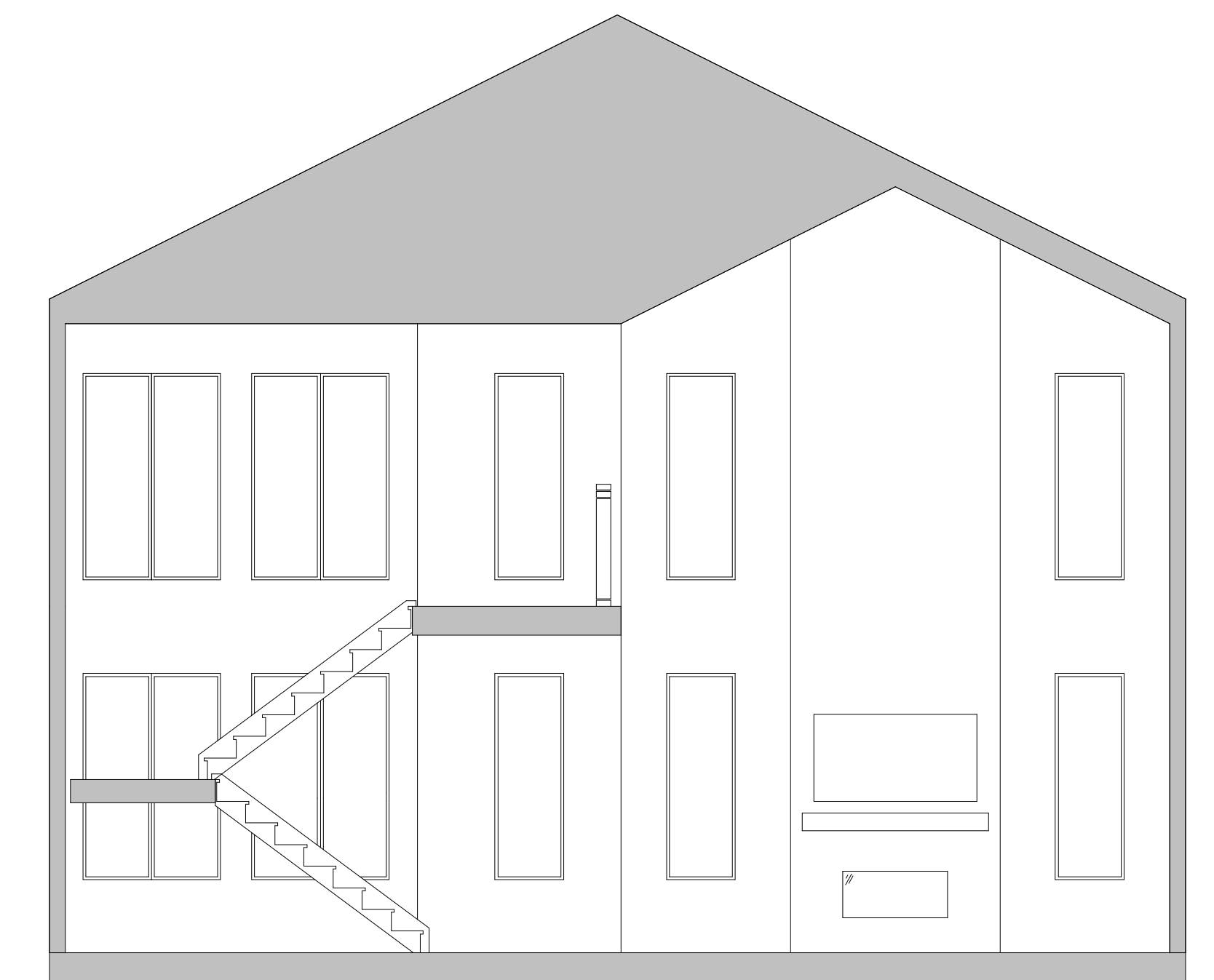
GREAT ROOM SECTION